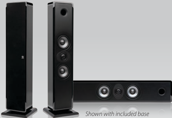
Shown with included base